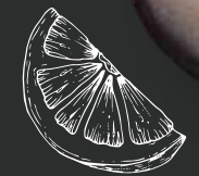
Honey Bourbon Salmon