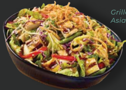
Grilled Asian Salad