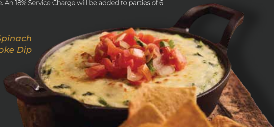
Cheesy Spinach Artichoke Dip

*This item can be cooked to requested temperature. Consuming raw or undercooked meats, poultry, seafood, shellfish, eggs may increase your risk of foodborne illness. While gluten free, vegetarian, and vegan items are available, this restaurant is unable to guarantee that any item is completely free of allergens. There is always a risk of cross-contamination. Please notify your server of any allergies or dietary restrictions you have. An 18% Service Charge will be added to parties of 6 or more.