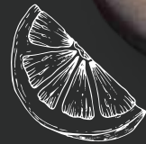
Honey Bourbon Salmon