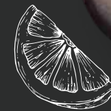
Honey Bourbon Salmon