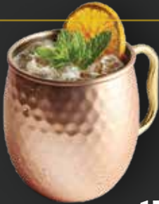
Blood Orange Mule

PEANUT BUTTER CUP 14.00 skrewball peanut butter whiskey, chocolate, cream, toasted marshmallows